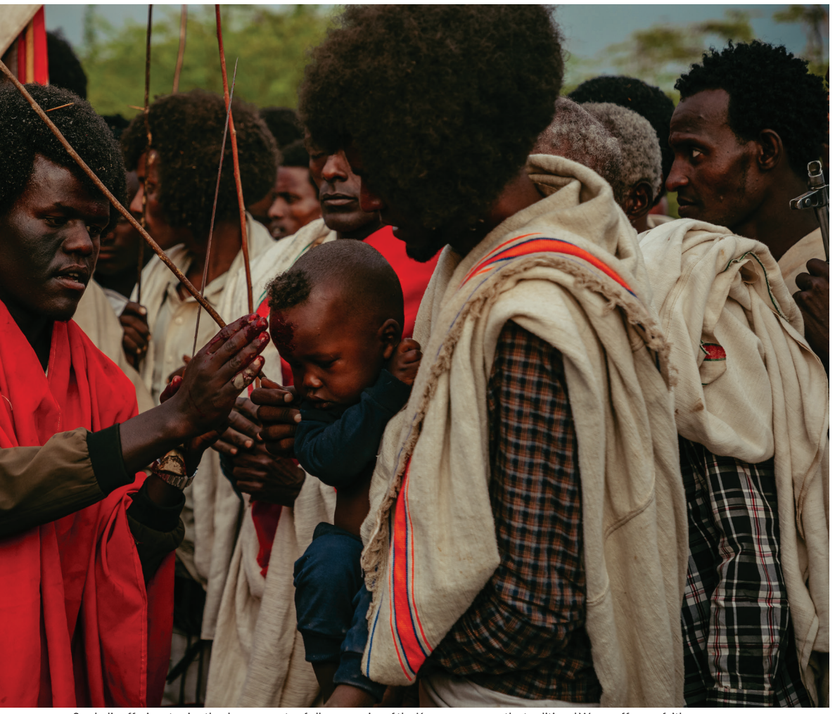
Symbolic offerings to give thanks are a party of all ceremonies of the Karrayyuu as per the traditional Waaqeeffannaa faith and the following that the contraction of the Karrayyuu as per the traditional Waaqeeffannaa faith and the following that the following that the following that the following that the following that the following that the following that the following that the following that the following that the following that the following that the following that the following that the following that the following that the following that the following that the following that the following that the following that the following that the following that the following that the following that the following that the following that the following that the following that the following that the following that the following that the following that the following that the following that the following that the following that the following that the following that the following that the following that the following that the following the following that the following that the following that the following the following the following that the following that the following the following the following the following the following the following the following the following the following the following the following the following the following the following the following the following the following the following the following the following the following the following the following the following the following the following the following the following the following the following the following the following the following the following the following the following the following the following the following the following the following the following the following the following the following the following the following the following the following the following the following the following the following the following the following the following the following the following the following the following the following the following the following

the true destiny of every living thing. The Karrayyuu carry out a range of ceremonies in celebration of Ayyana, which include the Atete, Hirsii, Gamesssa, Biyyoo, Jinfuu, Hujufa, and Jaari Celebrations.